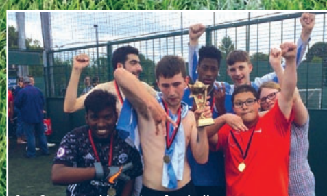
Our Supported Learning football team won the Brentford FC Community Cup, beating Richmond College 1-0 in a riveting final!